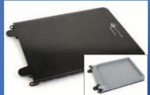
Palliative Extension - Solid