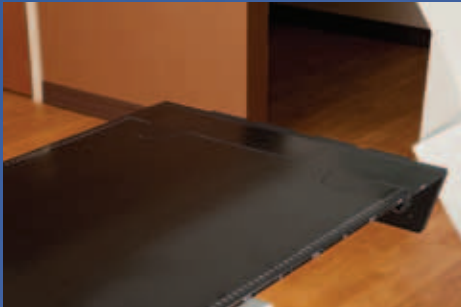
Varian End Plate