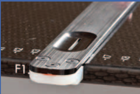
Prodigy™ 2 Lok-Bar™