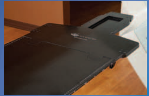
Posifix® Extension (Available soon)